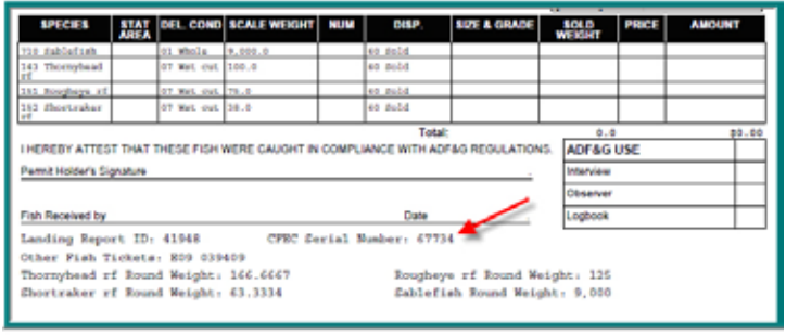
This is the CFEC serial or 'file' number for that identifies this fisher. It is equivalent to the NMFS ID.

The eLandings generated fish ticket includes quite a bit of information that can be helpful. Included on the fish ticket is the CFEC serial number, which replaces the SSN as the unique identifier of the fisher.